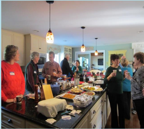
Getting ready to enjoy good food!