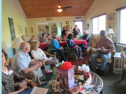
Plant Based Yankee Swap fun!