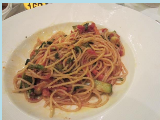
Veggie Pasta Dish for Dinner