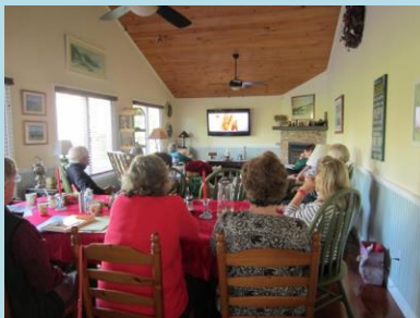
We also watched the telling new documentary, "Cowspiracy".