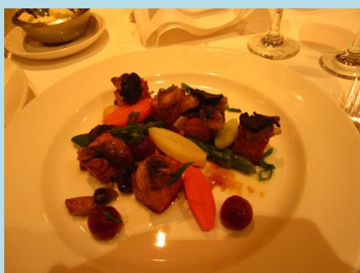
Roasted veggies with tofu.