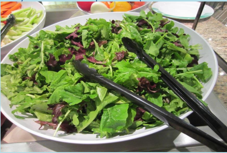
A variety of greens always available.

The photos below give you a hint of some of the choices. I also included the toxic foods that our neighbors down the street indulge in. I'm always amazed with all the health info available today that folks still pile their plates with oodles of eggs, bacon and sausage.