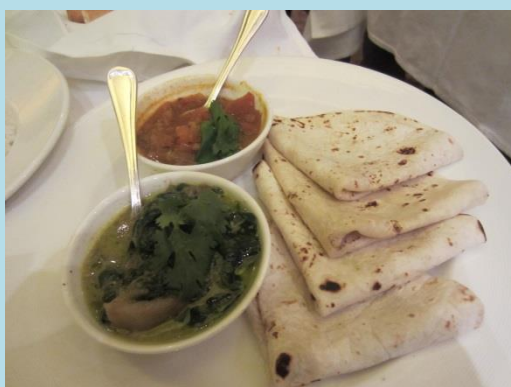
Indian dinner with rice on the side. So tasty!