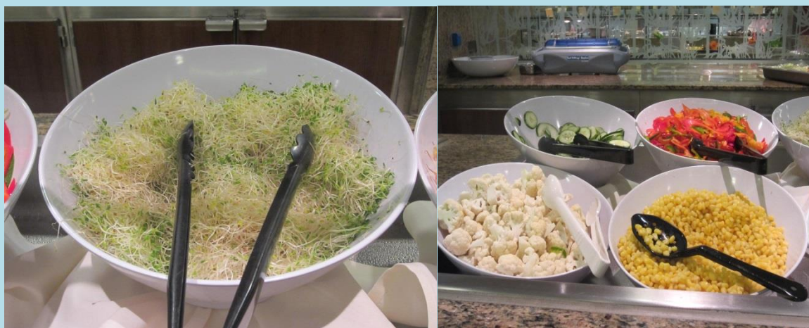
Lovely salad toppings!