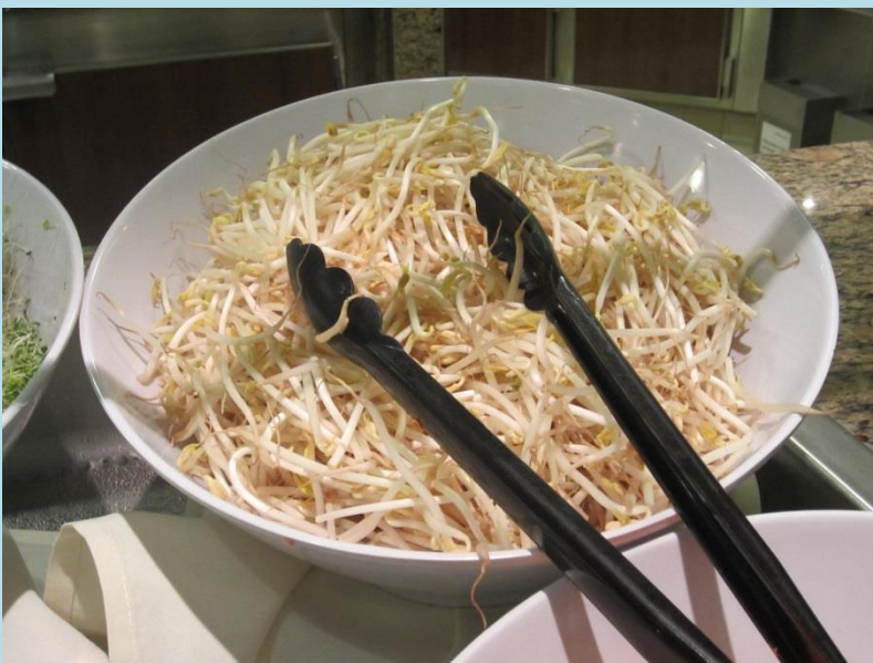
Mung bean sprouts - always a big hit!