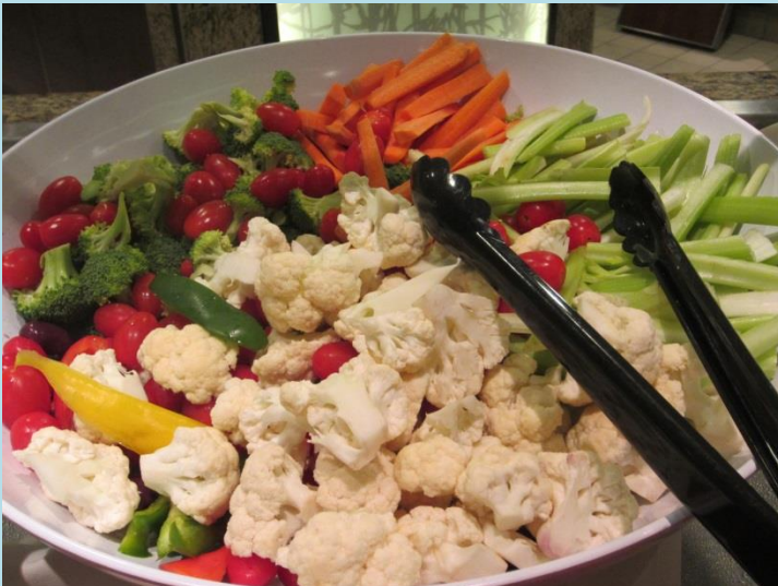
Lots of fresh vegetables and fruits.