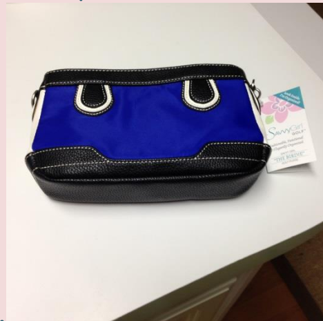
My Savvy Girl Golf Bag

They so kindly gifted me with one of their purses as a thank you for the program. I'm amazed at the workmanship of the purse. Very well made with much needed interior compartments. Especially neat is that the compartments are sided with mesh so one can see what's packed away. That's an answer to a woman's purse prayer! I'm including a photo of their remarkable work - which does not involve cruelty to any animal! Check out their website, listed below: